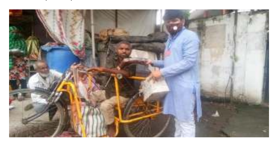
Our Students who work with NGO MALHAR distributing food and Blanket to beggars & needy