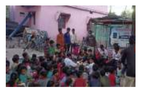
Volunteers of SSBS with Children in Rahatetoli