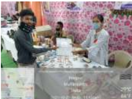
Paper Bags Distribution to the Students in the ED Exhibition in 2021-22