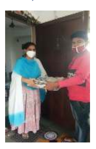
Alumni Collecting news paper scraps (Raddi)