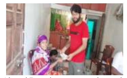
Alumni Donating money to the needy