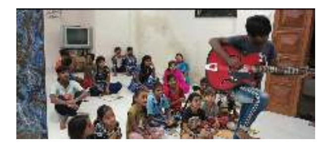
Volunteer entertaining the slum children